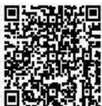
Director, Instructor OSHA.edu