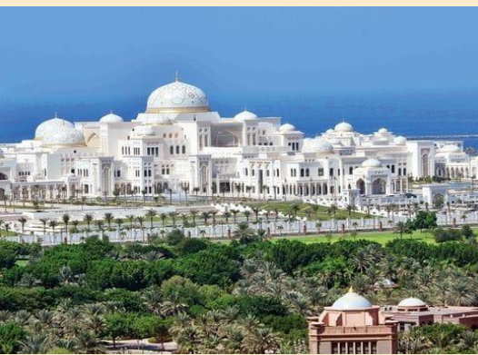
Al Raha Beach development