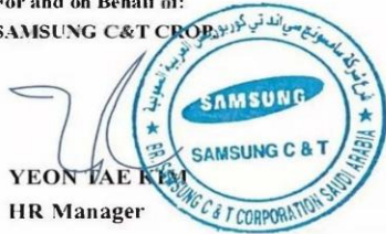
YEON TAE KIM HR Manager

ص ب 21 بقيق 31992 -المملكة العربية السعودية تليفون :+966 13 8870073 فاكس : +966 13 8870960 -رقم العضوية 147749 طريق الخبر الدمام السريع - برج أسمنت الشرقية- الدور الرابع- مكتب 401